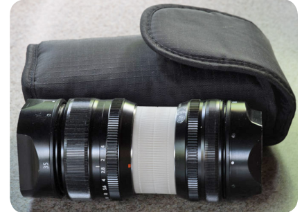
Doubled-ended lens cap with two lenses for the smaller mirrorless Fujifilm X Compact Systems Camera.

“Actually having the product and using it, and using your customer service...I’ve been most impressed with the company as a whole and the software.”