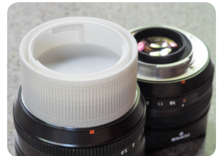
A double lens cap allows Krebs to change lenses with one hand without dropping his valuable equipment.