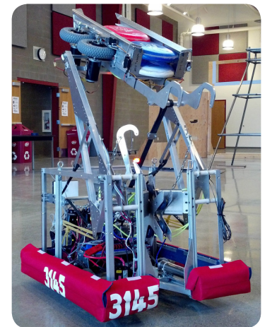
RoDel, the TeraViks' winning robot.