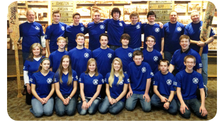
FRC Team 3145 TeraViks from Coeur d'Alene High School, Coeur d'Alene, ID.

These 19 enthusiastic students not only developed engineering and marketing skills, but also learned about beam deflection, statics and strength of materials, troubleshooting and public speaking. They used their passion for design and fabrication to create an award winning solution.